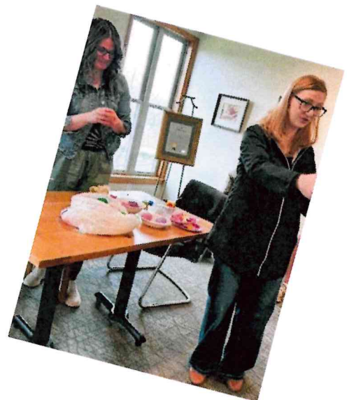
Easter Pictures submitted by Kathy Hill