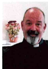
Fare Thee Well!

Well, we have survived (and thrived) another Holy Lent. We prepared well for Holy Week. We are ready once more to walk with Jesus his Passion. Our reward is the fantastic reality of God's promise of Resurrection.