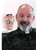
This Troublous Life...

Well, we're back to school and settling into our routines. Pumpkin farms are in full swing, and the week has more football available to watch on TV than is probably healthy. Such is the reality of autumn in Northeast Ohio.