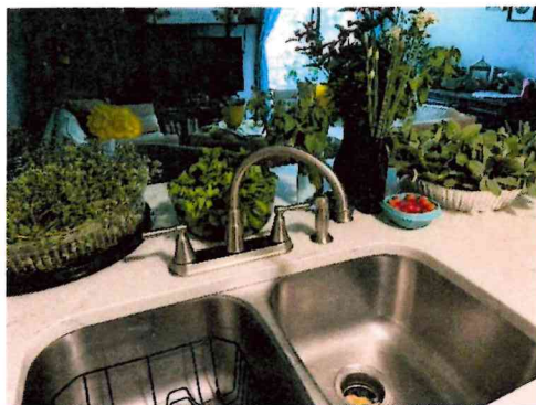
Herbs from the Garden