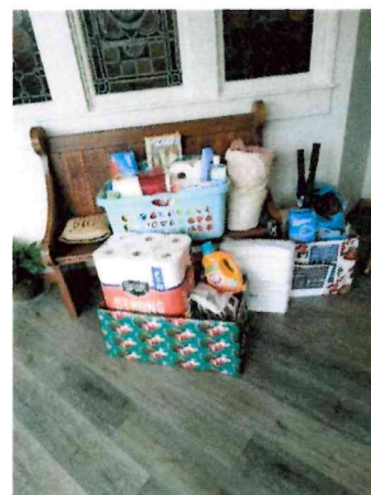
Christmas in July for Forbes House was a great success- Thank you!!!!