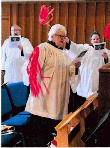
Grace Choir on Pentecost