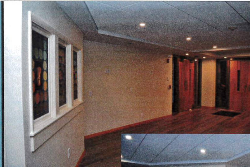
Entrance Area Before and After