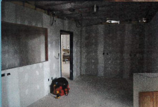
Admin Office Before and After