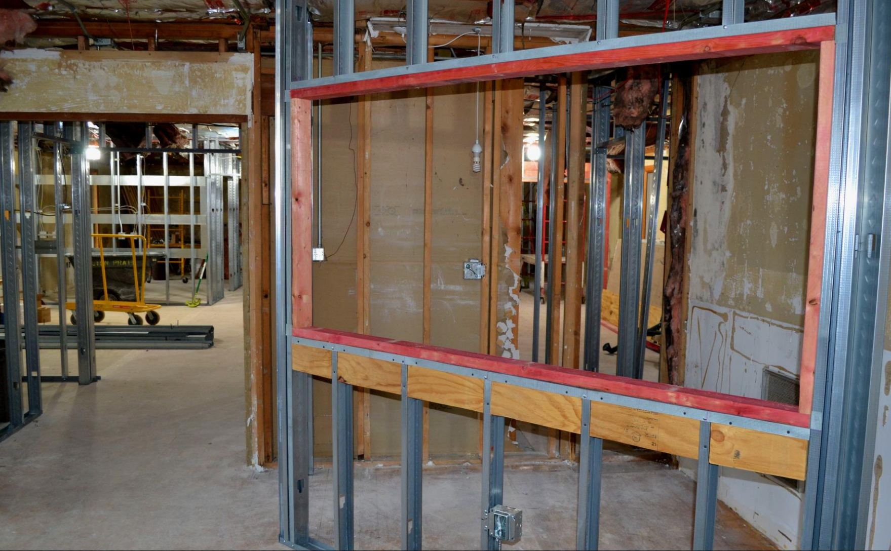
LIBRARY ENTRANCE AREA OF CHURCH WITH NEW STAINED GLASS WINDOW DISPLAY AREA...