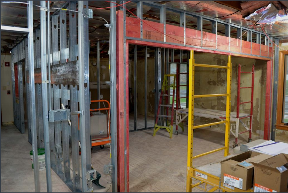
LOOKING INTO NEW CONFERENCE ROOM