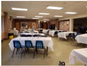
We are ready