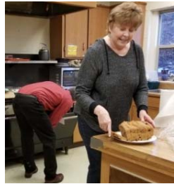
Our faithful cooks and helpers