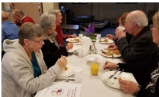
Some of our parishioners enjoying the fellowship