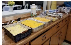
Food made by our generous volunteers