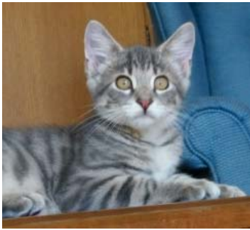
Nik's baby picture

August 19 th we celebrate the First Anniversary of Nik's adoption day